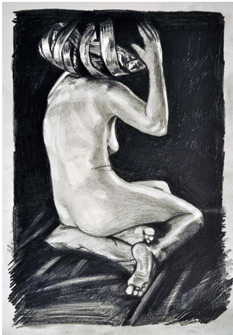
Damian Moppett, Figure Study for Caryatid , 2010 graphite on paper paper: 14 x 11 inches framed: 14 1/2 x 11 1/2 in.

" Moppett has demonstrated a desire to look backward and inward simultaneously."